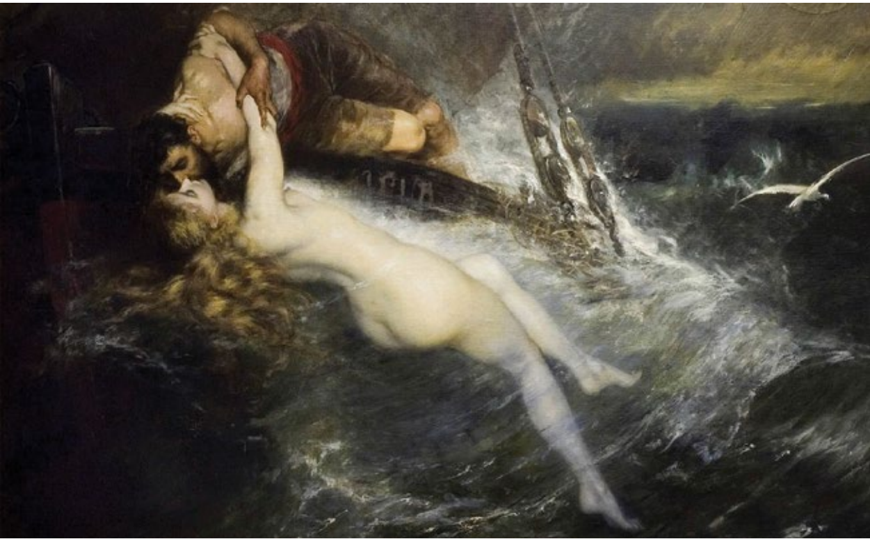
Public domain in the U.S. for unspecified reason but presumably because it was published in the U.S. before 1924.

16 th century writer and cartographer Olaus Magnus, whose famous Carta Marina obsessively catalogued the many monsters of Scandinavian seas, noticed that fishermen believed that if you catch a mermaid “and do not presently let them go, such a cruel tempest will arise, and such a horrid lamentation of that sort of men comes with it, and of some other monsters joining with them, that you would think the sky should fall.”