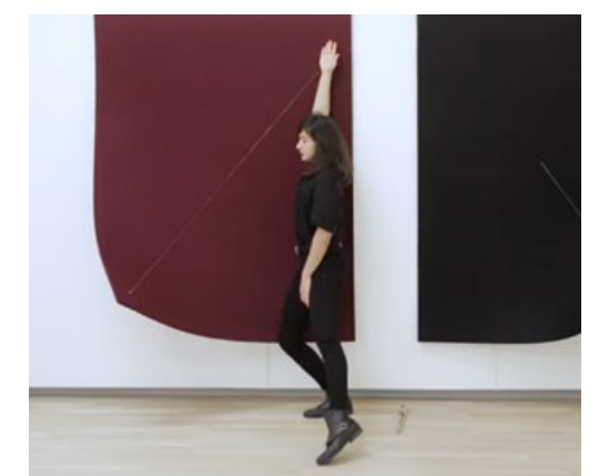
From the top: "Barricade #3", 2016 / Naama Tsabar's portrait / "Work On Felt (Variation 9 and 10) Bordeaux and Black", 2017.

For more information on Naama Tsabar's upcoming installation at Faena Art Center Buenos Aires , visit www.faenaart.org