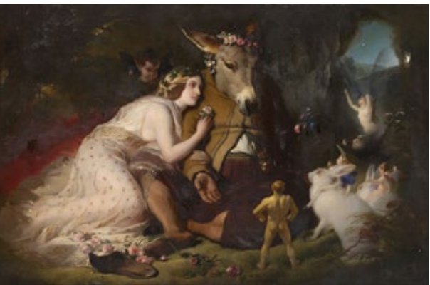
Public domain in the U.S.

In Japan, few things are considered as fortunate as objects which represent or emulate the female